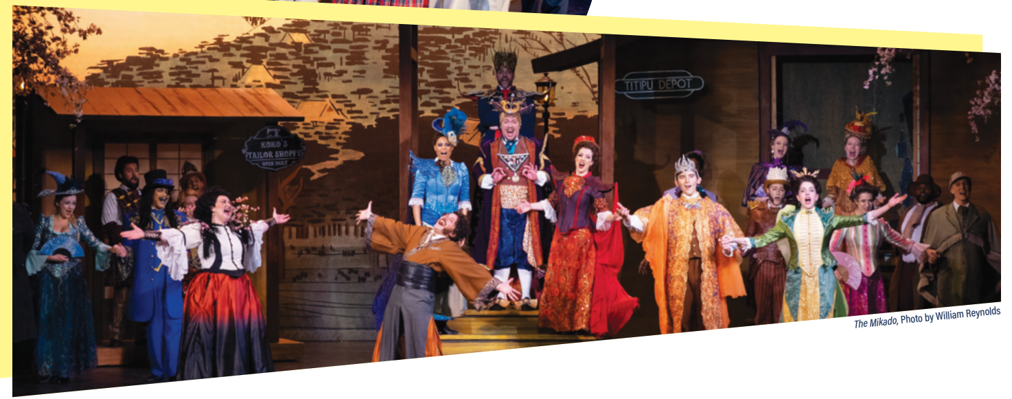
The Mikado