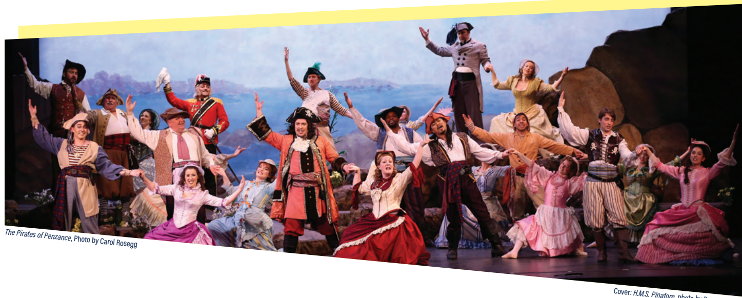
The Pirates of Penzance