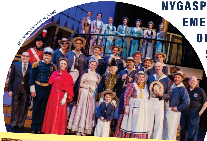
H.M.S. Pinafore

As NYGASP prepares for this change in leadership, we must “Keep calm and patter on!” – and raise one million dollars to be invested over the coming years to build upon our legacy and carry us into the decades ahead.