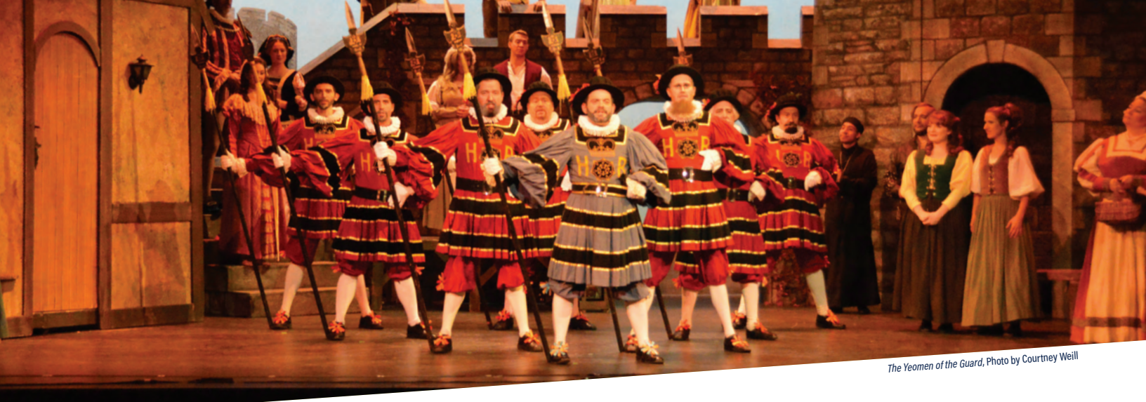
The Yeomen of the Guard, Photo by Courtney Weill